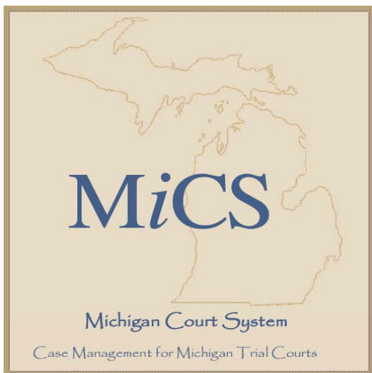
NextGen application official name and logo

Since our last update, the project team has named the new application MiCS (Michigan Court System) to represent one consolidated court application that can be used by all trial court jurisdictions.