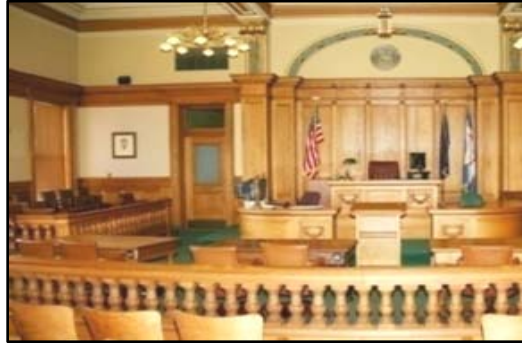
A trial court courtroom.

1 Trial courts decide cases. Most cases start and finish here. There is one judge, witnesses, and a jury. Trial courts are in every county in Michigan.