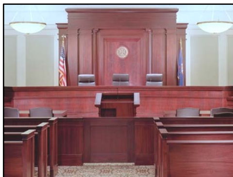
Court of Appeals