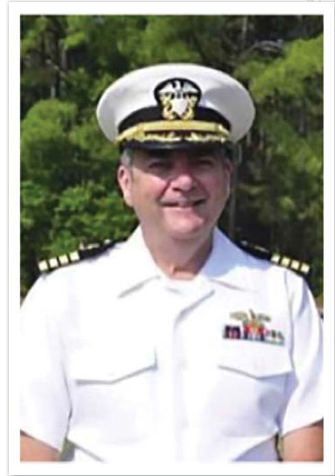
Wearing his Navy “whites”