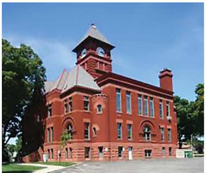
Mason County Courthouse in Ludington