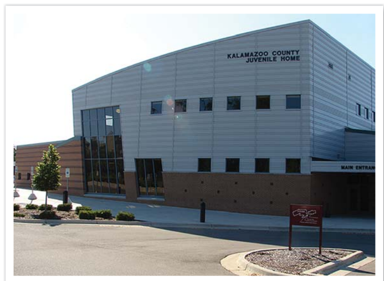
The Kalamazoo County Juvenile Home is home to the KEYS program.