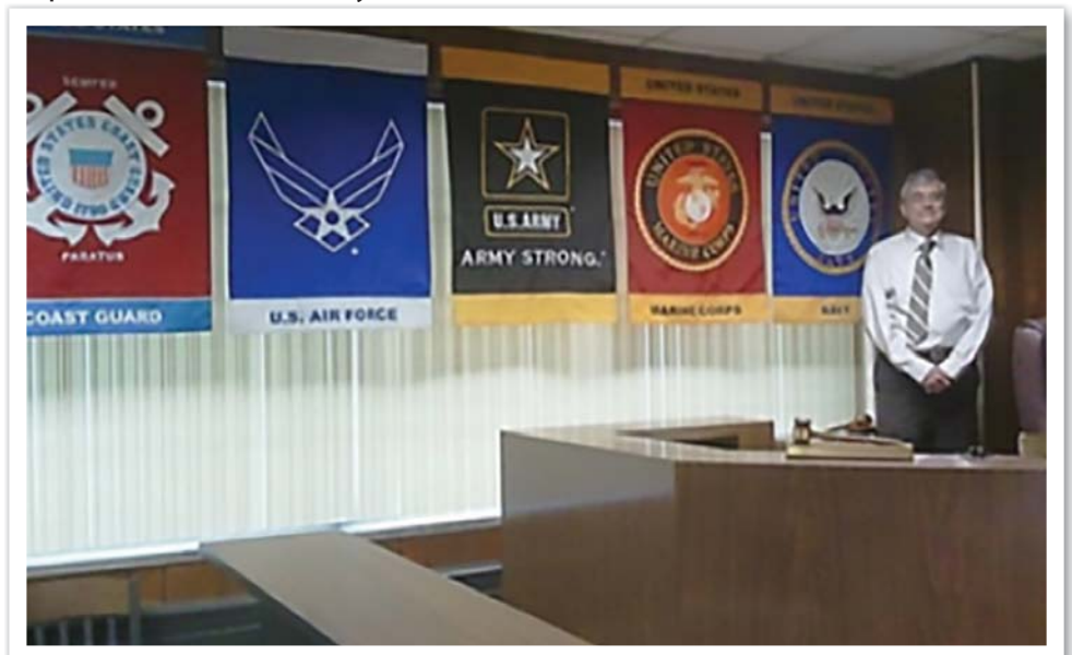
Judge Bronson’s courtroom displays flags to represent each military branch of service.