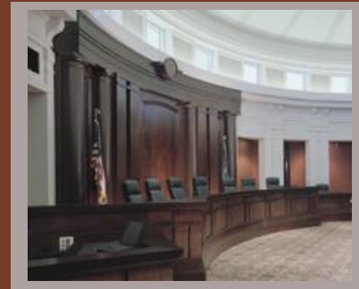
Supreme Court bench, 6th floor, Hall of Justice

Infants and young children may accompany their caregivers at oral arguments but their attendance is not recommended given the formal nature of the proceedings. They should be removed from the courtroom immediately if they become a disturbance.