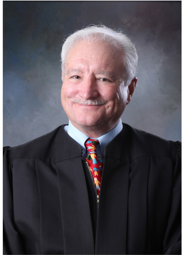
Judge Fred Mulhauser

The court school and juvenile drug treatment court programs focus on adolescent brain development and developing treatment plans that improve the youth’s functioning while addressing educational and vocational skills deficits. These plans take into account personal, emotional, and family problems.